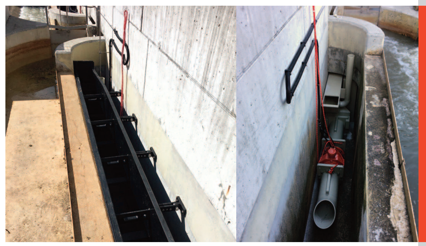
View into the right, dry outflow channel downstream the preliminary sedimentation section.