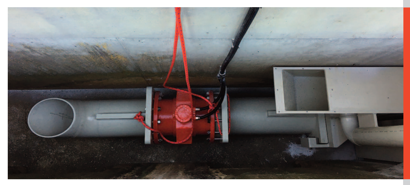
Installation of the IDM unit of the stationary flow metering system and of the impoundment pipe in one of the two shafts.