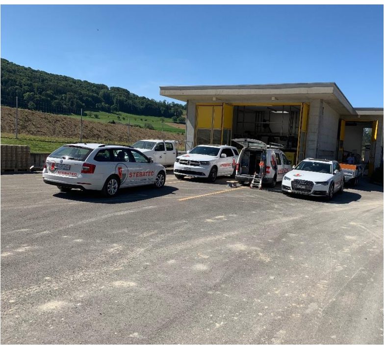
Picture 2 und 3: The old control cabinet has been replaced. Stebatec was responsible for the planning, conversion, control and commissioning - the corresponding Stebatec specialists were therefore on site on the day of conversion.