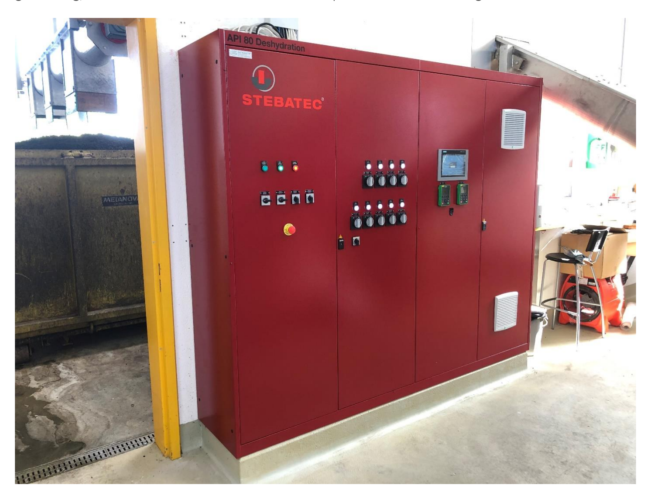
Picture 1: View after the modification of the sludge drying control system.

To replace a control system in the ongoing clarification operation requires meticulous planning, extensive preparatory measures and, ultimately, great commitment during the effective conversion phase. This was also the case during the partial conversion project for the sludge drying where Stebatec was responsible for the electrical planning, the switch cabinet construction, the software programming, the on-site reconstruction measures up to the commissioning.