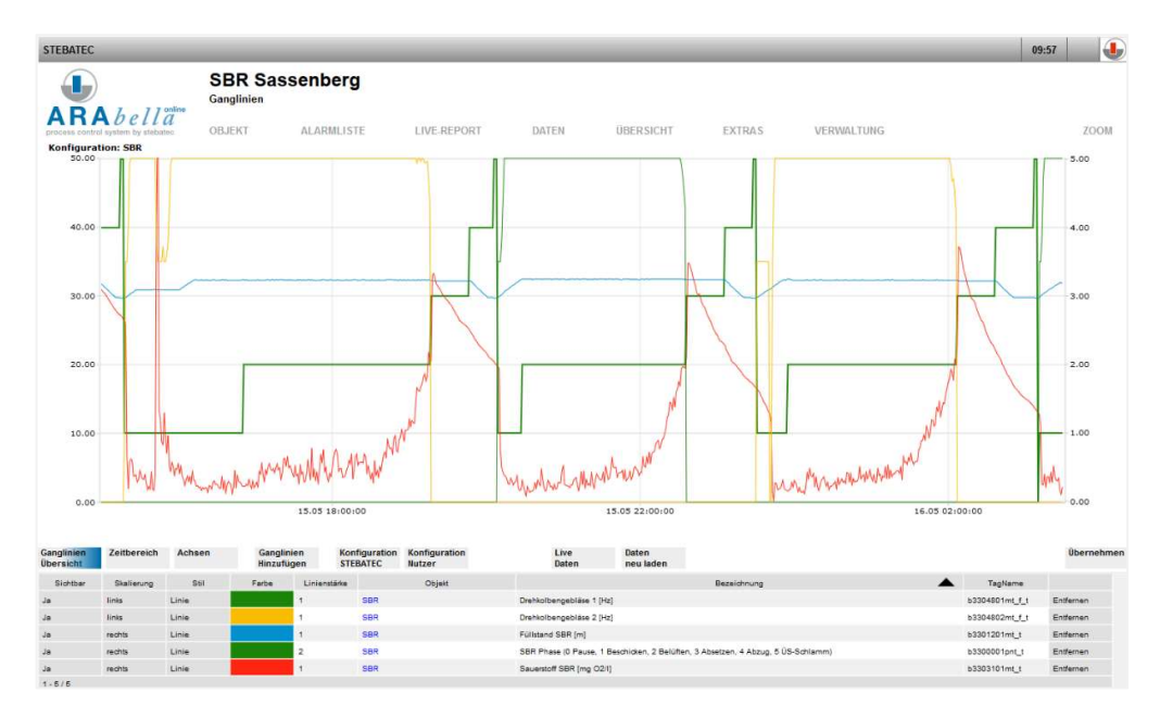
Figure 4. The graphs represent 3 cycles. The duration of the cycles is not the same for each cycle. The aeration phase is terminated when the oxygen concentration rises above 1.8 mg/l.

Thanks to the visualizations and the clear description of the process steps, the operating personnel has gained a lot of process engineering knowledge. They now feel comfortable in supervising the plant, the cleaning performance is stable and is completely sufficient to maintain the discharge conditions.